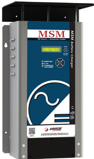
Unit Shown: MSM-30-24V-U1